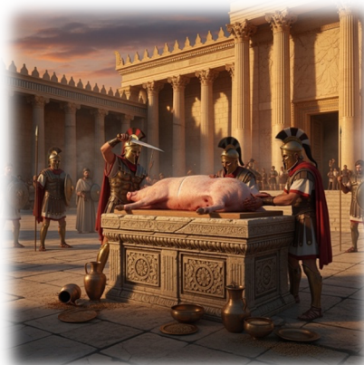
Antiochus' Evil Decrees:

Then the king wrote to his whole kingdom that all should be one people, and that all should give up their particular customs. All the Gentiles accepted the command of the king. Many even from Israel gladly adopted his religion; they sacrificed to idols and profaned the Sabbath. And the king sent letters by messengers to Jerusalem and the towns of Judah; he directed them to follow customs strange to the land, to forbid burnt offerings and sacrifices and drink offerings in the sanctuary, to profane sabbaths and festivals, to defile the sanctuary and the priests, to build altars and sacred precincts and shrines for idols, to sacrifice swine and other unclean animals, and to leave their sons uncircumcised. They were to make themselves abominable by everything unclean and profane, so that they would forget the Law and change all the ordinances. He added, "And whoever does not obey the command of the king shall die."