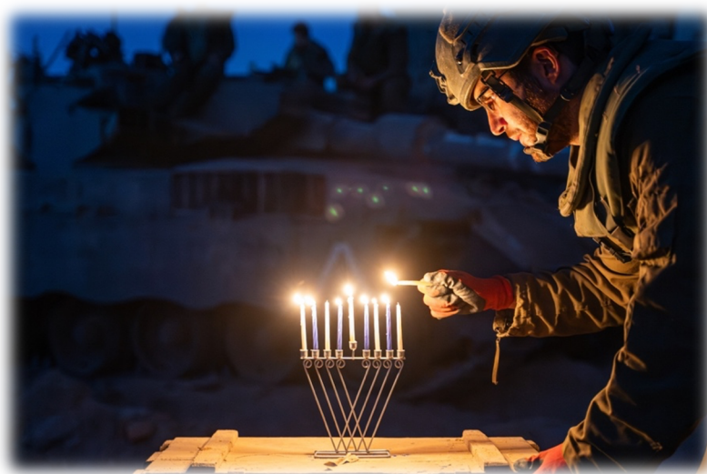
IDF soldier celebrating Hanukkah in Gaza (2024)